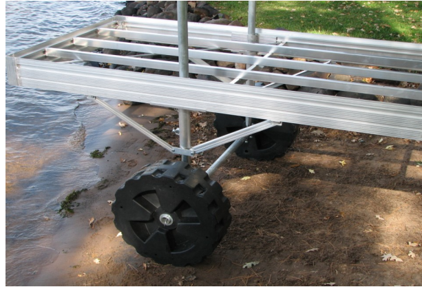
"Traditional Style" Wheel System

Accessories are a snap with DAKA'S fast track clip system and our hidden nut channel. Adding or adjusting your accessories is made easy. Simply clip our proprietary accessory bracket to the dock and fasten through our hidden nut channel. You will have a clean looking fit and a finish with no exposed holes or sharp edges.