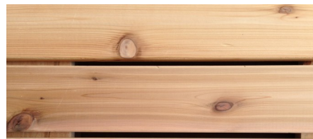
Western Red Cedar